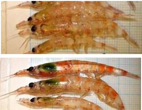
Figure 3: Krill feeding colour.

Krill Colouration : The presence or absence of green/brown colouration (see Figure 3) of the intestines or liver (which indicated feeding) should be recorded for all krill measured.