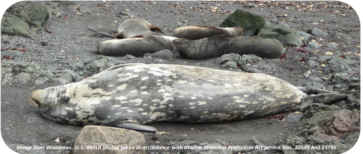
U.S. AMLR photos taken in accordance with Marine Mammal Protection Act permit Nos. 20599 and 25786.