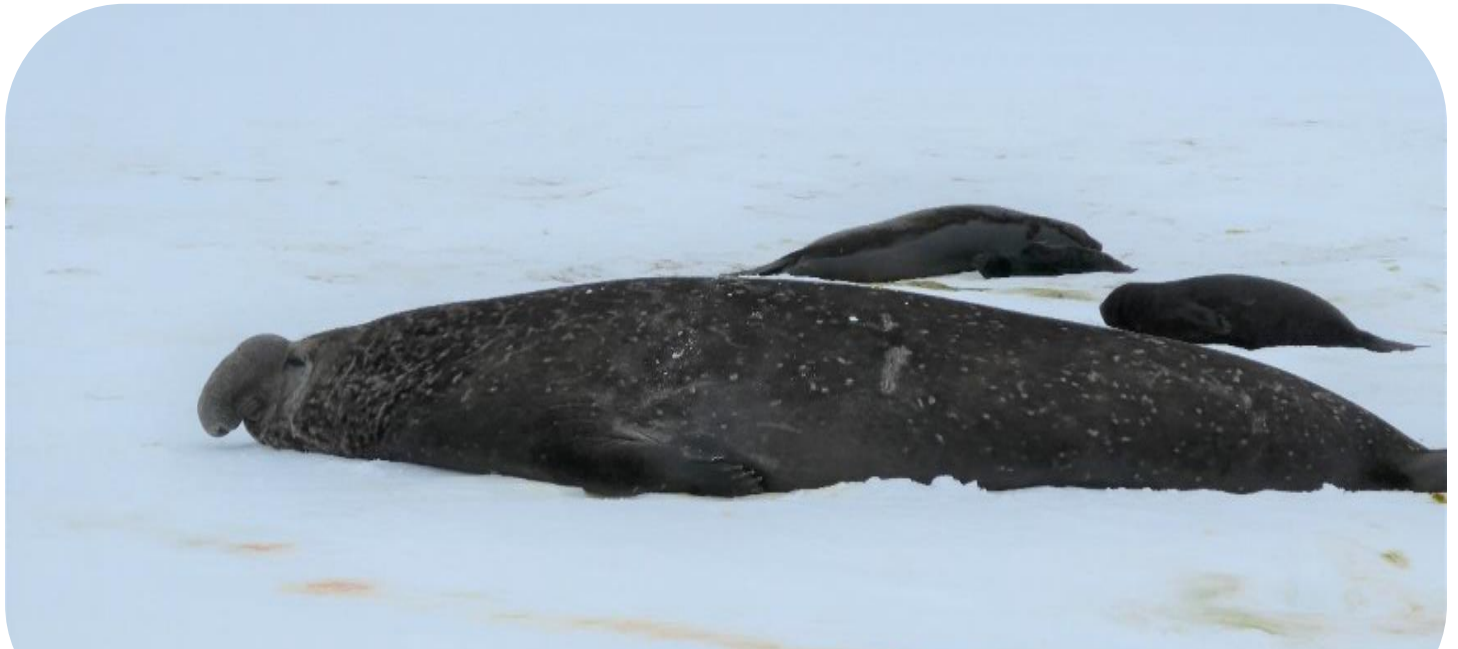
U.S. AMLR photos taken in accordance with Marine Mammal Protection Act permit Nos. 20599 and 25786.