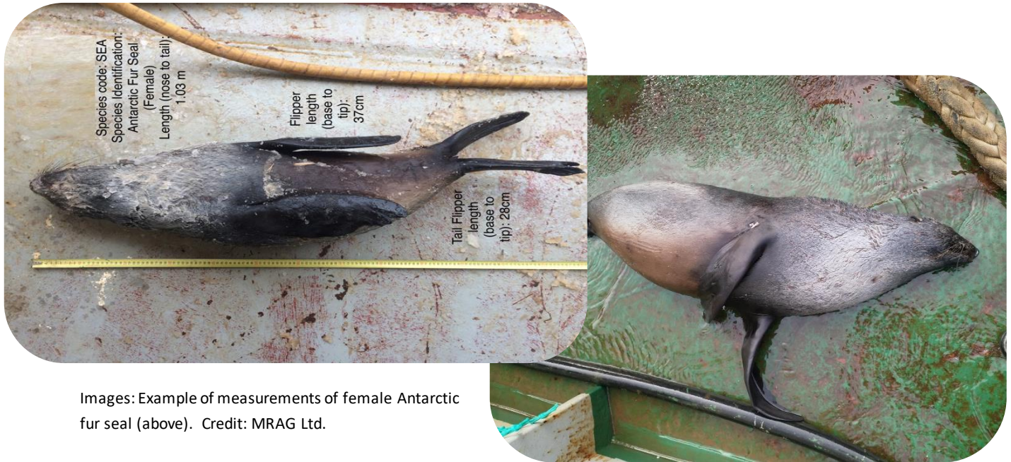
Images: Example of measurements of female Antarctic fur seal (above).