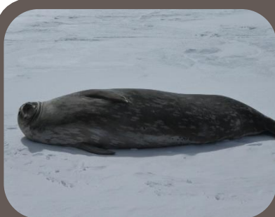
Image Sam Woodman. U.S. AMLR photos taken in accordance with Marine Mammal Protection Act permit Nos. 20599 and 25786.

Similar Species: Ross and crabeater seals are the most similar. Note the proportionately larger and wider neck and head, and stripes of the Ross seal; and for the other species, characteristics of the muzzle, head, neck, colour pattern, flippers, and vibrissae. Smearred pale spots are similar to leopard seals, however Weddell seals can be differentiated by a blunt muzzle.