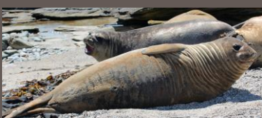
U.S. AMLR photos taken in accordance with Marine Mammal Protection Act permit Nos. 20599 and 25786.

Female adult size: 2–3 m and 400-800 kg.