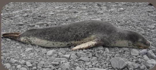
U.S. AMLR photos taken in accordance with Marine Mammal Protection Act permit Nos. 20599 and 25786.

Similar Species: when seen well, leopard seals are unmistakable. At a distance, however, they might be confused with crabeater or Weddell seals. To rule out other species, note head size and shape, overall coloration and length of foreflippers.